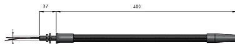
Light Dimensions in mm