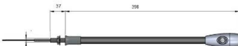
Light Dimensions in mm